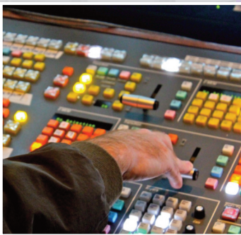
Image Recording & Editing

Let the JI professionally produce your next internal education video. Videos are shot inside a state-of-the-art hospital, accompanied by crisp clinical images with labels and concise physician explanation of disease states, device deployment, or both. The JI has clinical experts in the areas of neurosurgery and spine surgery, vascular, and cardiovascular medicine at-the-ready to enrich your educational videos.